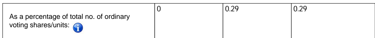
Table 3. Change in respect of rights/options/warrants over shares/units of Listed Issuer