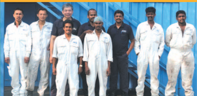
Productivity Winning Team July - September 02

The consultant has started work with us. Staff from all levels have been briefed about the objectives of this project. All are enthusiastic and are looking forward to the prospects of improvement, both on an individual and a corporate level.